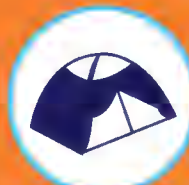
Ocean Front Campgrounds