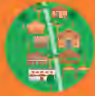
Ngwe Saung Village