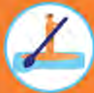
Stand Up Paddle ( SUP ) & Surf