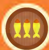
Traditional Fish Drying in Thazin & Sinma Village