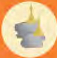
Brother & Sister Pagoda