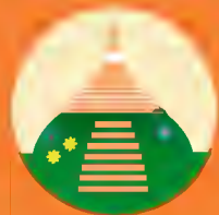
Ngwe Saung Pagodas

Ngwe Saung is home to an amazing number of sights and attractions. Be sure to get on a motorbike and checkout the nearby villages!